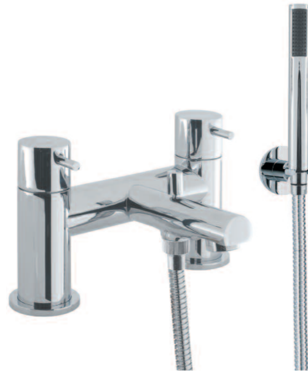
BATH SHOWER MIXER WITH KIT deck mounted LP KL422DC £319.00