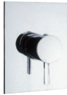
MANUAL SHOWER VALVE recessed HP1 KL0004RC £130.00