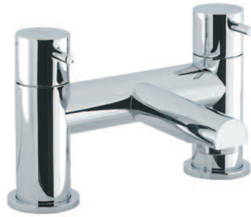
BATH FILLER deck mounted LP KL322DC £255.00