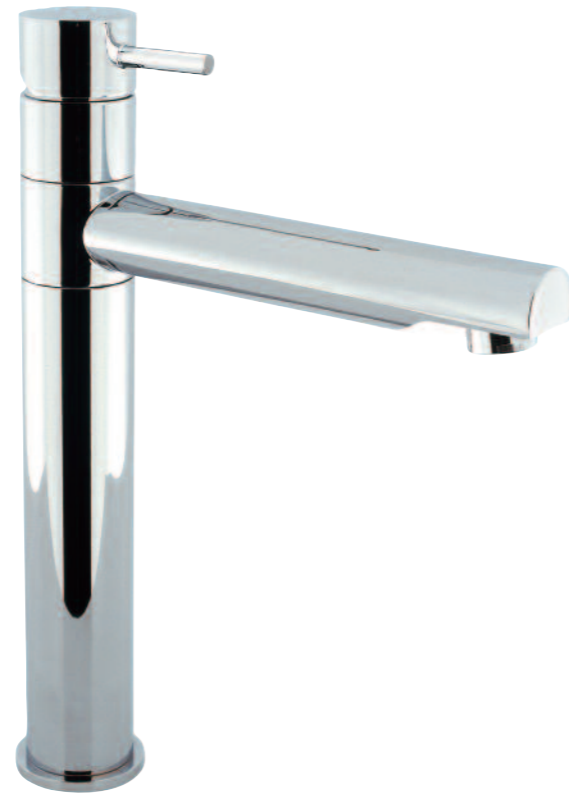
BASIN TALL MONOBLOC with no pop-up waste, swivel spout LP KL116DNC £239.00