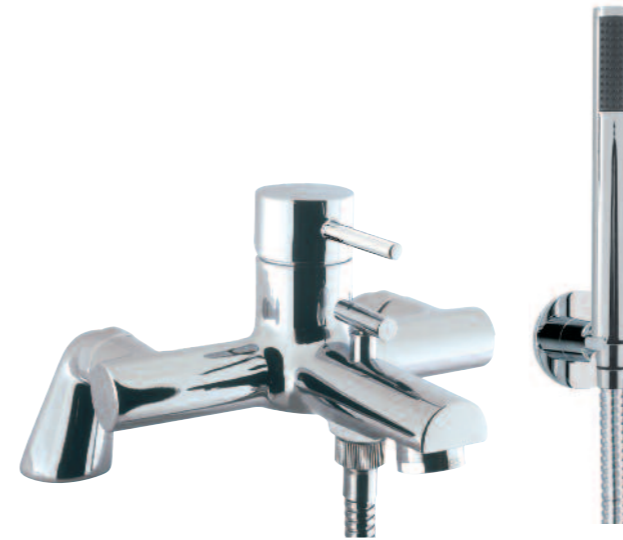
BATH SHOWER MIXER WITH KIT wall mounted HP1 KL421WC £245.00