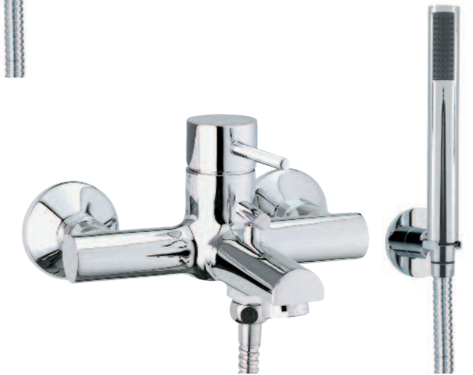
BATH SHOWER MIXER WITH KIT wall mounted HP1 KL421WC £245.00