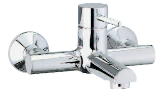
BATH FILLER wall mounted HP1 KL321WC £195.00