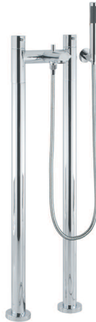
BATH SHOWER MIXER WITH KIT deck mounted LP KL422DC £319.00