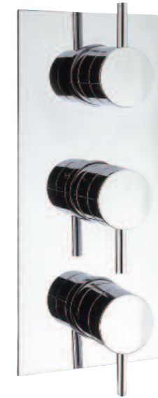
THERMOSTATIC SHOWER VALVE 3 CONTROL portrait, recessed LP KL2000RC £519.00