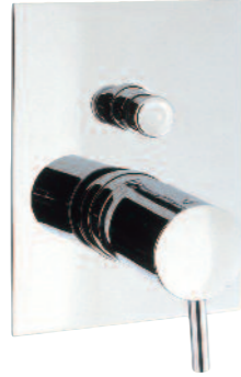
MANUAL SHOWER VALVE WITH DIVERTER recessed HP1 KL0005RC £165.00