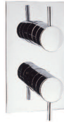
THERMOSTATIC SHOWER VALVE recessed LP KL1000RC £339.00