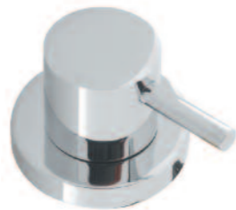
4 WAY DIVERTER VALVE deck mounted, 2 water inlets, 2 water outlets HP1 KL0008DC £149.00