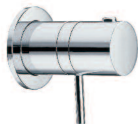
THERMOSTATIC SHOWER VALVE recessed, wall mounted HP1 KL0010RC £299.00