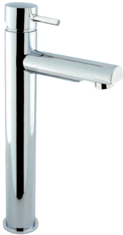
BASIN TALL MONOBLOC FIXED SPOUT with no pop-up waste LP KL112DNC £239.00