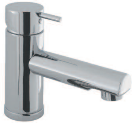
BATH FILLER MONOBLOC deck mounted LP KL310DC £189.00