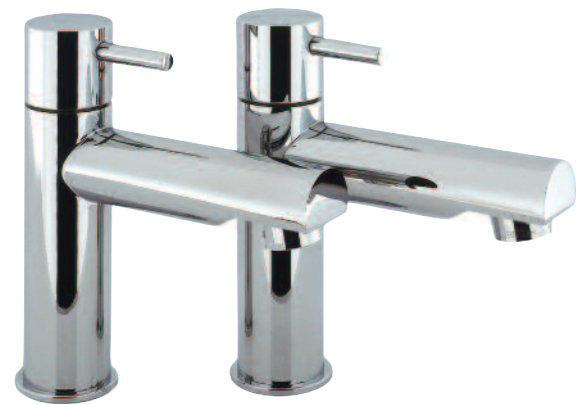
BATH PILLAR TAPS pair LP KL340DC £139.00