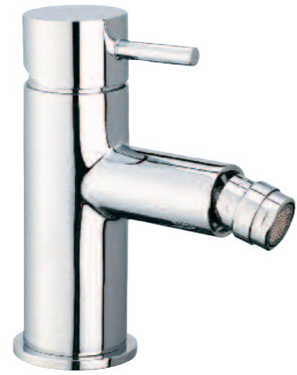
BIDET MONOBLOC with pop-up-waste LP KL210DPC £175.00