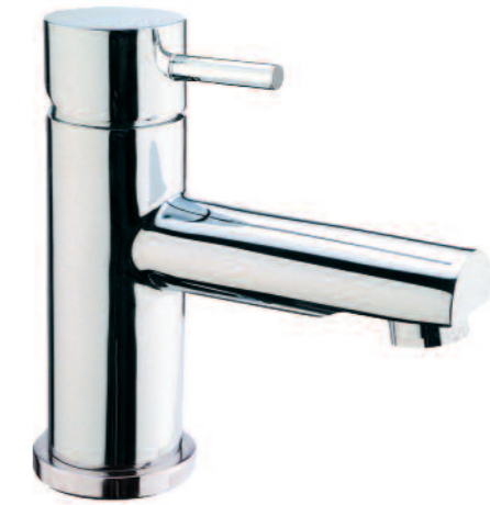
BASIN MONOBLOC with no pop-up-waste LP KL110DNC £165.00