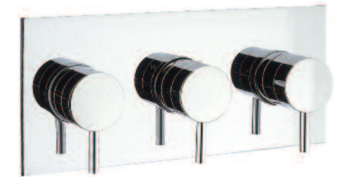
THERMOSTATIC SHOWER VALVE 3 CONTROL landscape, recessed LP KL2001RC £519.00