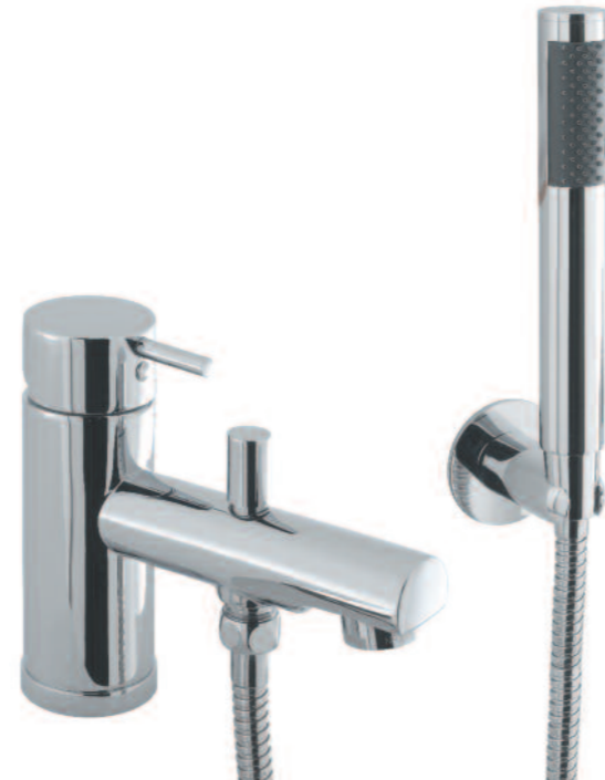
BATH SHOWER MIXER MONOBLOC WITH KIT deck mounted LP KL410DC £199.00