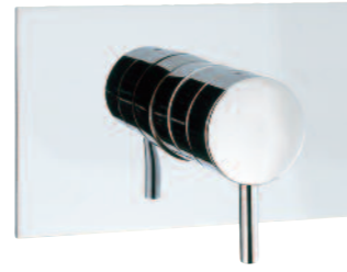
SHUT-OFF VALVE LP KL0001RC £130.00