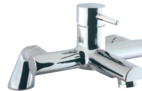
BATH FILLER wall mounted HP1 KL321WC £195.00