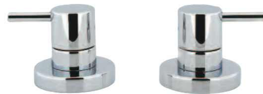
PANEL VALVES deck mounted LP KL350DC £175.00