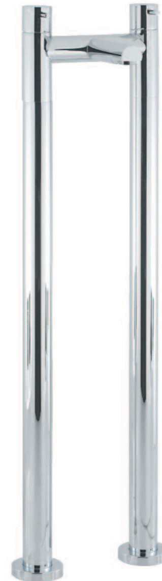
BATH FILLER deck mounted LP KL322DC £255.00