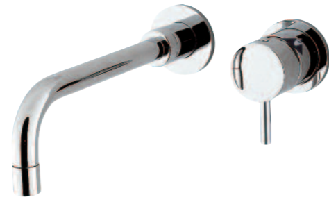
BASIN 2 HOLE SET wall mounted LP spout lengths 140mm or 210mm KL120WNC £199.00