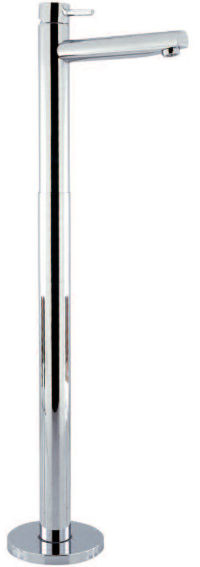
BATH FILLER MONOBLOC floor standing, h 870mm HP3 KL315FC £520.00